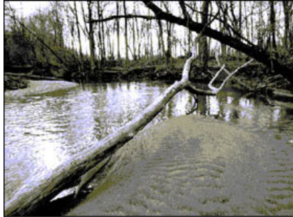
This photo of Crooked Creek at Juan Solomon Park in Marion County, Indiana, appeared on the first page of a research questionnaire about green space.